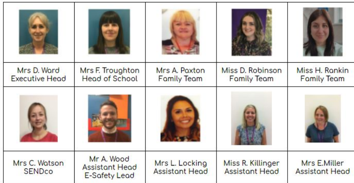
Our designated safeguarding and E-Safety staff

At Morpeth Road our Safeguarding Leads are: