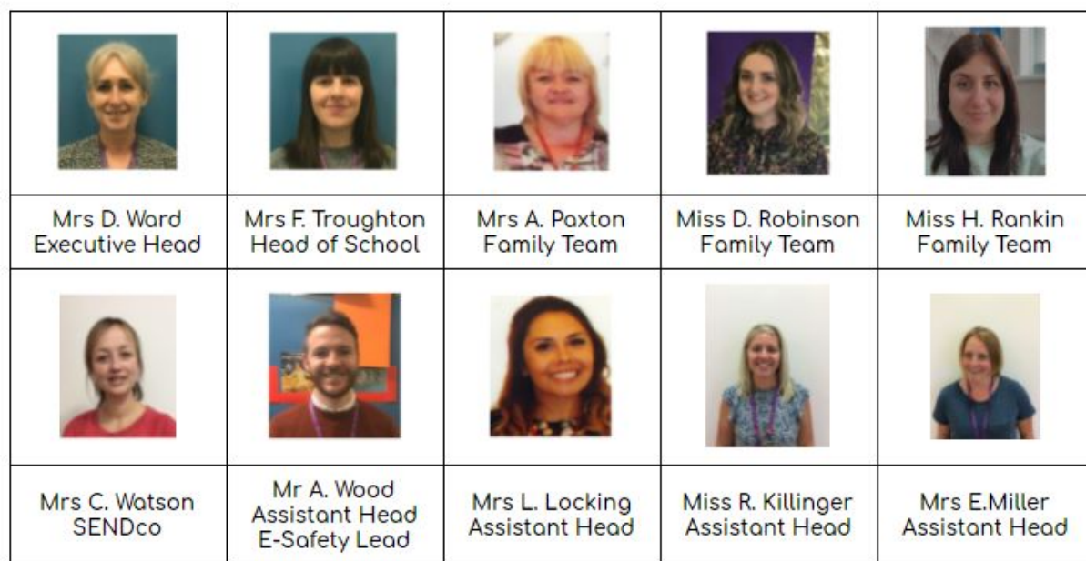
Our designated safeguarding and E-Safety staff

At Morpeth Road our Safeguarding Leads are: